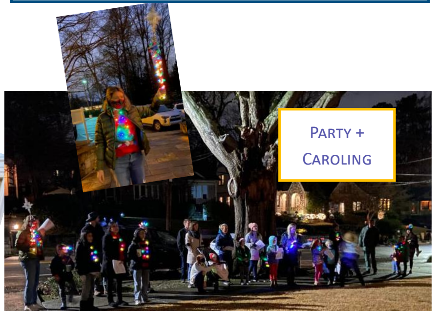
PARTY + CAROLING