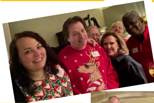
LGBT & FRIENDS XMAS PARTY