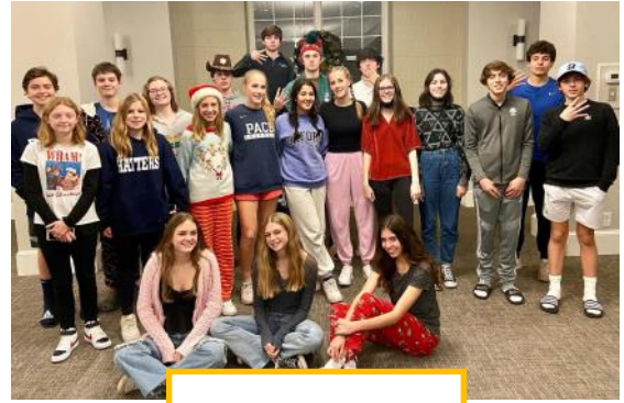
YOUTH GROUP XMAS PARTY