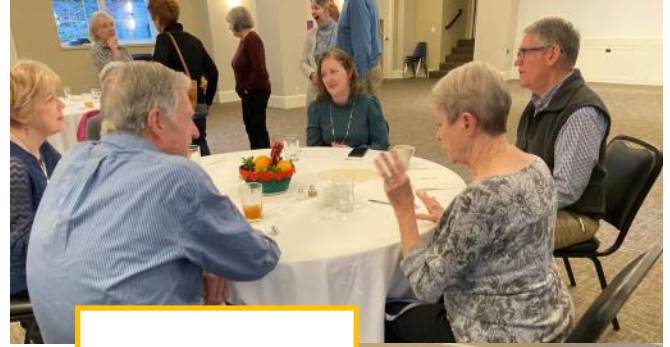
THE RETURN OF ONE GRAY HAIR