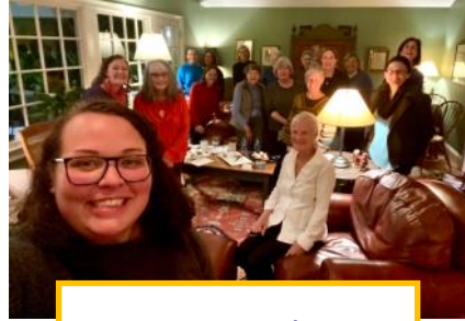
WOMEN'S ROUNDTABLE ADVENT GATHERING