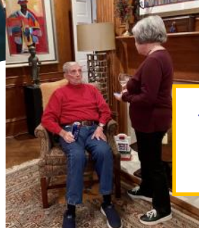
THEOLOGY ON TAP CHRISTMAS