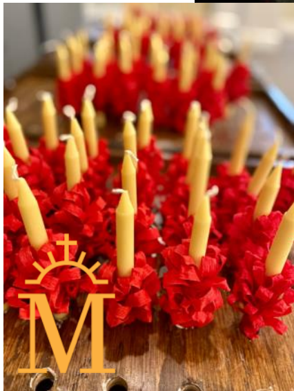
THE MORAVIAN LOVE FEAST