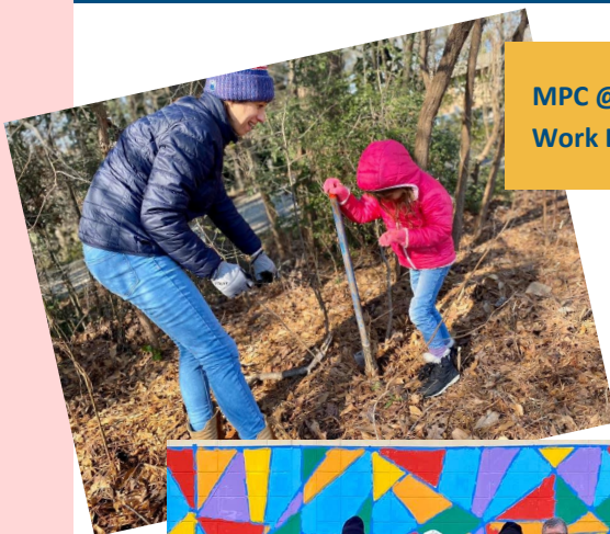
MPC @ Memorial Drive Ministries Work Day on MLK Day, 2/20/2020