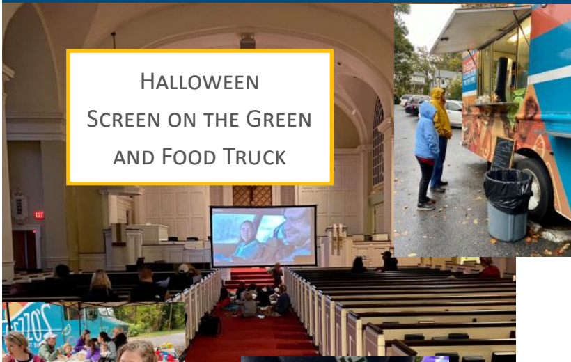
HALLOWEEN SCREEN ON THE GREEN AND FOOD TRUCK