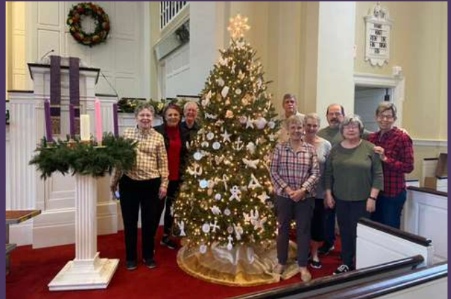
ADVENT DECORATING WITH THE FLOWER GUILD