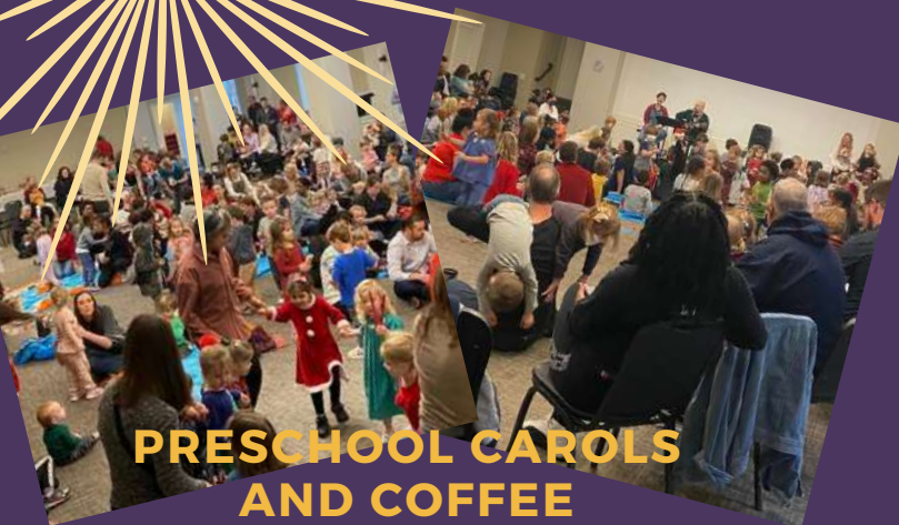
PRESCHOOL CAROLS AND COFFEE