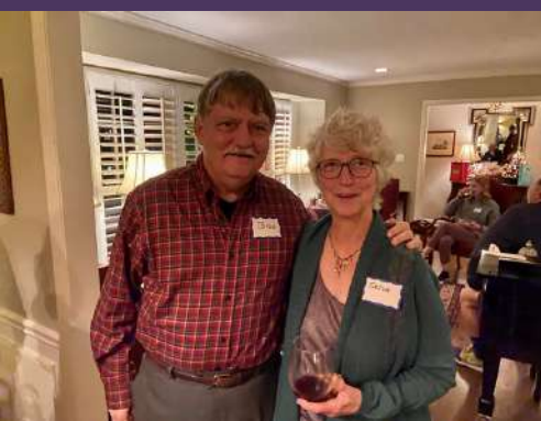
LGBT & FRIENDS CHRISTMAS PARTY