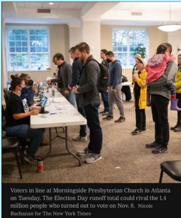
Voters in line at Morningside Presbyterian Church in Atlanta on Tuesday. The Election Day runoff total could rival the 1.4 million people who turned out to vote on Nov. 8.